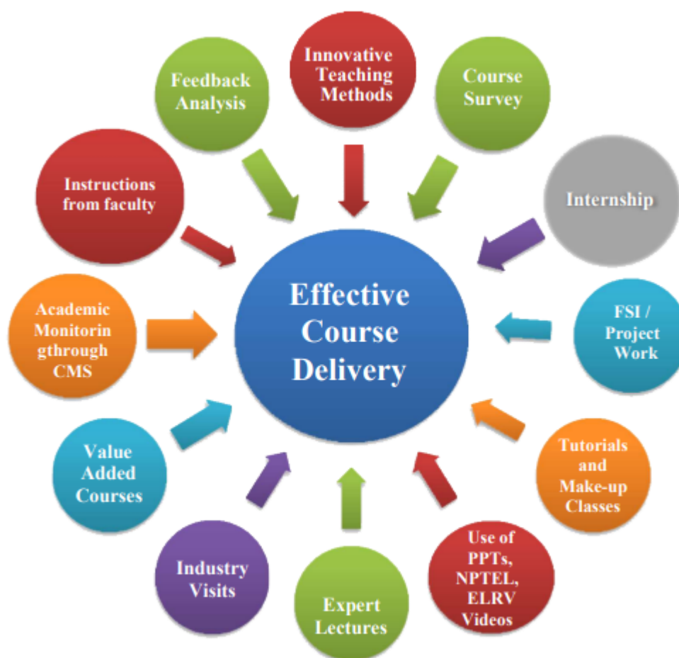
Figure 2: Course delivery

Contents beyond curriculum are identified and taught both in the classroom and in the laboratory to expose student learning to recent trends in the industry. Figure 2 shows the course delivery process.