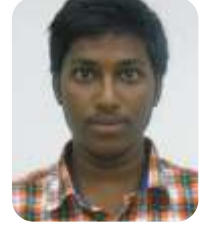
16951A0576 - CSE K LOKESH