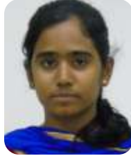
16951A04J6 - ECE GSN TEJASWINI