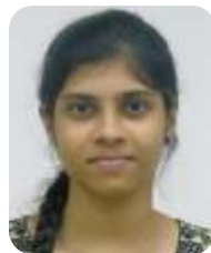
16951A05C5 - CSE N PRATHYUSHA