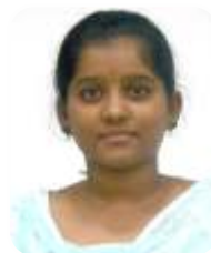
16951A2147 - AERO T RAJU PREETHI