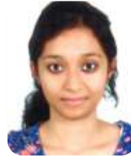
16951A1242 - IT SRI SINDHU MANDURI