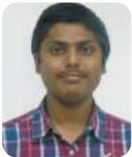
16951A0319 - MECH Y GNANADEEP