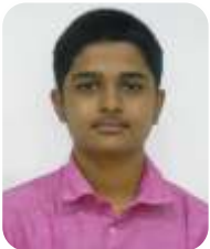
16951A0598 - CSE L NAVEEN