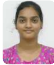
16951A1240 - IT K SRI LAKSHMI