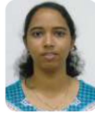
16951A04H9 - ECE DVL SRAVYA