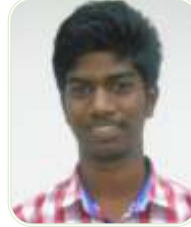
16951A2102 - AERO AJAY B