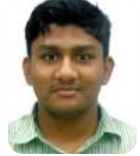
16951A2103 - AERO P AKASH