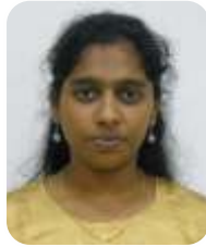
16951A04H8 - ECE U SHRAVANI