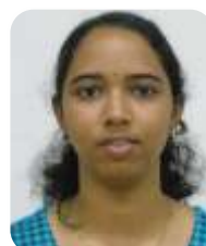
16951A04H9 - ECE DVL SHARVYA