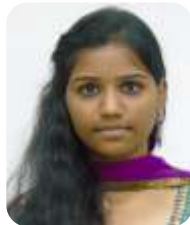
16951A04A9 - ECE S PRATHVI