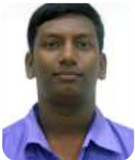
16951A2112 - AERO T BLESSINGTON