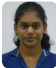
16951A0516 - CSE K ANIMA