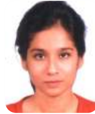
16951A2114 - AERO N DHEERUJA