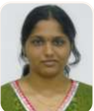
16951A05K0 - CSE V SREE VAISHNAVI