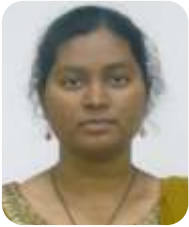
16951A2127 - AERO DOVA JEEVANA