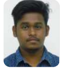
16951A05B0 - CSE D NEOL RAJU