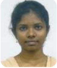
16951A05C4 - CSE M PRATHYUSHA