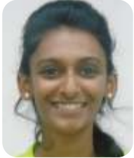
16951A04H2 - ECE S S SAMEEKSHA