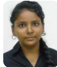
16951A04N3 - ECE KATTA YAMUNA