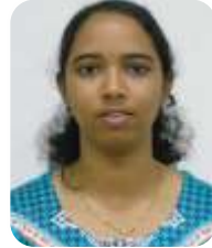
16951A04H9 - ECE DVL SRAVYA