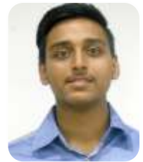
16951A2180 - AERO RESHAB SAVANA