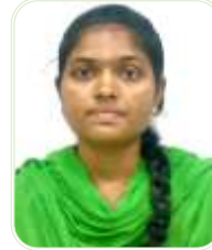
16951A2193 - AERO S SRINITHI