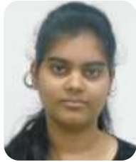
16951A2185 - AERO SIMRANA