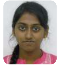
16951A05A1 - IT K NIHARIKA