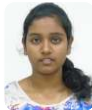
16951A1252 - IT G V N APOORVA