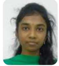
16951A05D1 - CSE GATTU RACHANA