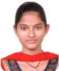
16951A1251 - IT SVN SANTOSHA SRAVANI