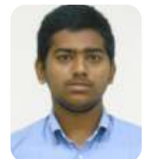
16951A05N5 - CSE SVS ADITYA