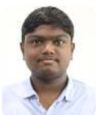
17955A0206 - EEE DARAM DHANRAJ