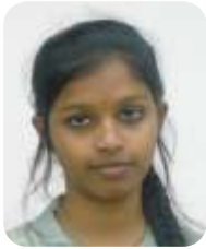
16951A2187 - AERO B SONI