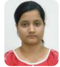
16951A1201 - IT ADITI SATI