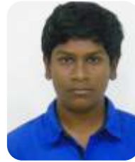
16951A0569 - IT MOTKURI KIRITI