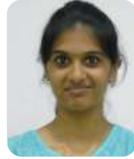
16951A04J3 - ECE SSS MADHAVI