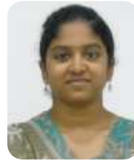
16951A1241 - IT K SRI SAI DURGA