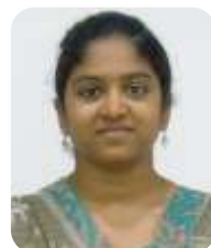
16951A1241 - IT K SRI SAI DURGA