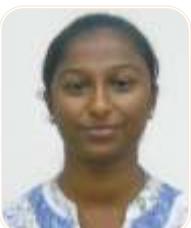
16951A0510 - CSE BADRI AKHILA