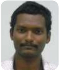
16951A0539 - CSE G ESHWAR