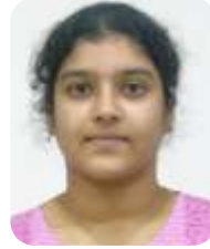
16951A05E9 - CSE GANGA SAHITHI