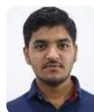
17955A0208 - EEE SHIRURI GANESH