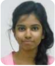
16951A05P2 - CSE YOSHITA B