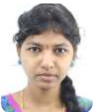
17955A0405 - ECE PULA EESHASREE