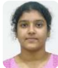
16951A05E9 - CSE GANGA SAHITHI