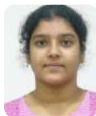
16951A05E9 - CSE GANGA SAHITHI