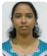
16951A04H9 - ECE DVL SRAVYA