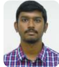
16951A05A0 - CSE PA NEHANTH