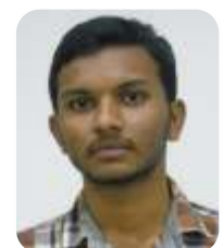
16951A05G6 - CSE PENTI SAI TEJA