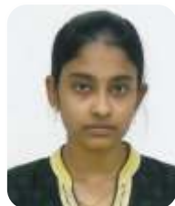
16951A05P0 - CSE V YAGNASHREE