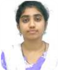
16951A2197 - AERO T SWESHIKA