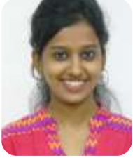
16951A0580 - CSE P MAHIMA