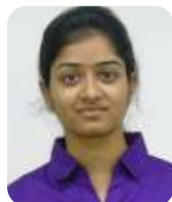
16951A1230 - IT RAAVI RAJYA LAKSHMI