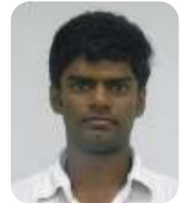
16951A0229 - EEE V SHIVA