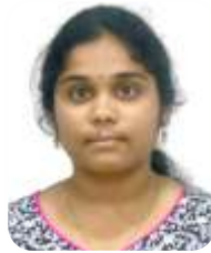
16951A2163 - AERO B SAI DEEKSHA