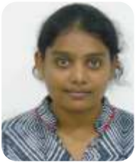
16951A05A7 - CSE U NISHITHA