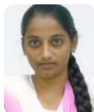
16951A05M8 - CSE UMA DOBBALA