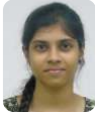
16951A05C5 - CSE N PRATHYUSHA