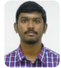
16951A05A0 - CSE P NEHANTH