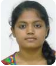
16951A05D4 - CSE N RAJASHREE