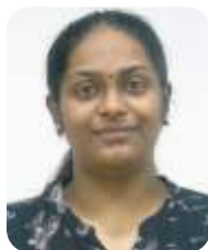
16951A2145 - AERO K PRAGNA BHARATHI