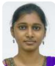
16951A05L4 - CSE R SRJANA