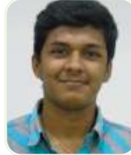
16951A04F7 - ECE D SANDESH