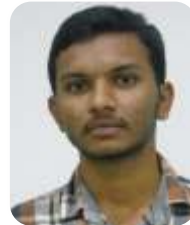
16951A05G6 - CSE PENTI SAI TEJA