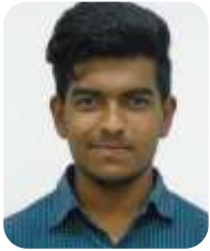
16951A04L2 - ECE J UMESH