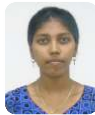
16951A2167 - AERO ADAPA SAI SHREYA