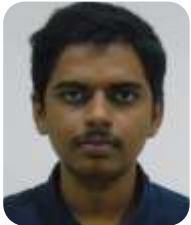
16951A0532 - CSE AKKI DATTATREYA