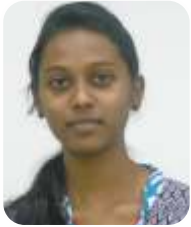
16951A2189 - AERO SRAVANI ELASARI