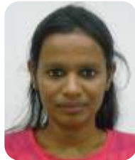
16951A0526 - CSE BEGARI BHAVANI