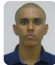
16951A0360 - MECH CHOKKI PUNITHSAI