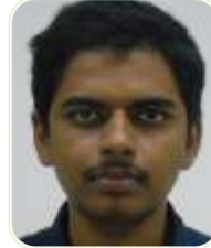
16951A0532 - CSE A DATTATREYA