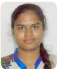
16951A2142 - AERO NIKHIL PRIYA V