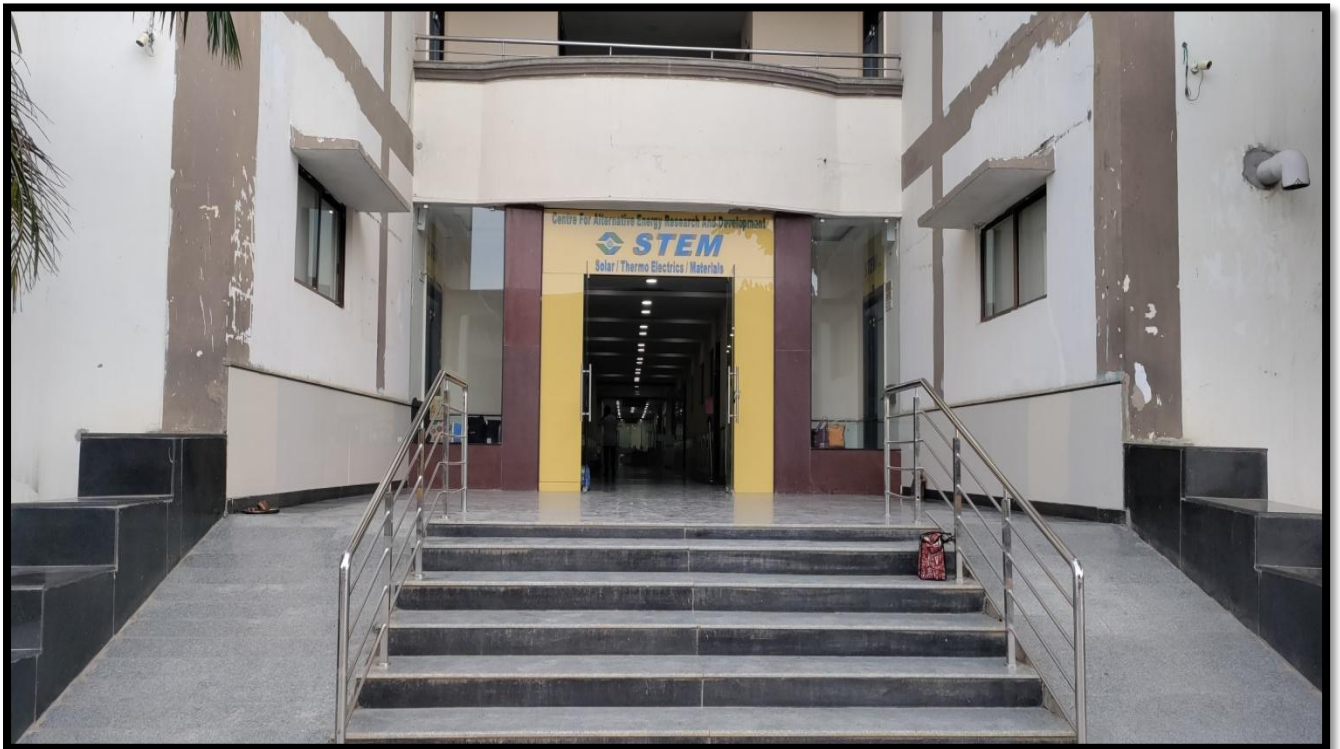
Barrier Free Ramps