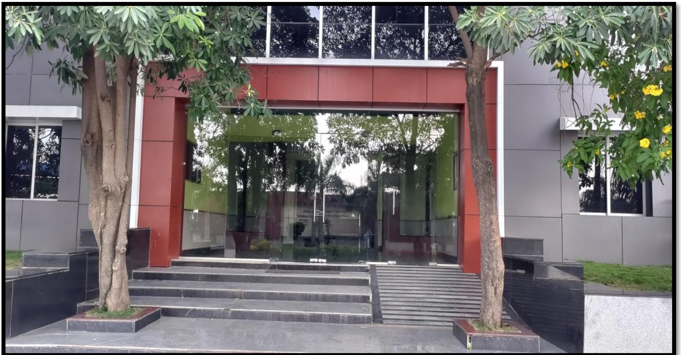
Barrier Free Ramps